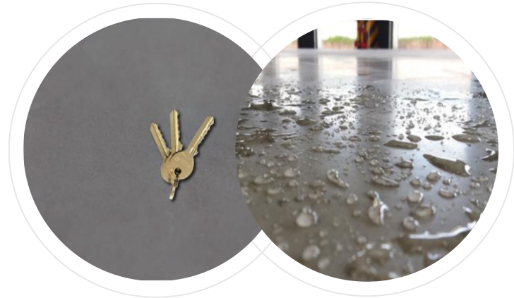
Densified Concrete Floor